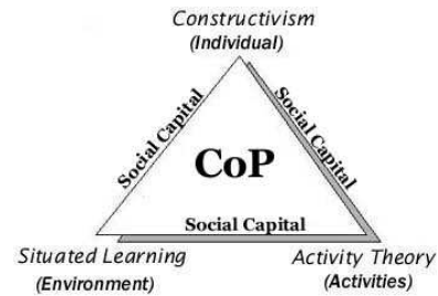
Figure 1. Theoretical model

To help build a sustainable online community of learners we rely on three theories of how individuals receive and process knowledge in CoPs and online learning environments (OLEs).